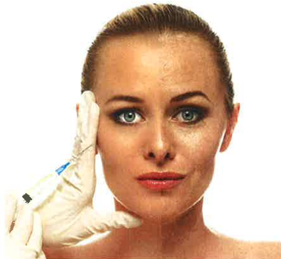
Although it has been used off-label for crow's feet for years, the FDA approval of Botox Cosmetic for this indication is driving new patients to aesthetic practices.