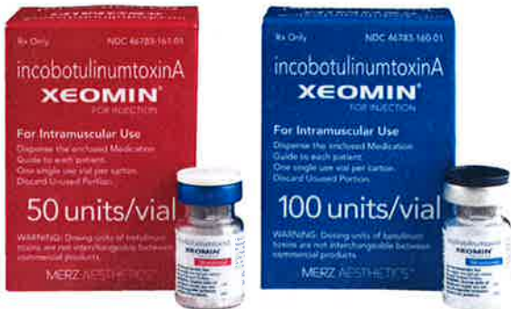
The main differentiating point for Xeomin is that it does not require refrigeration.