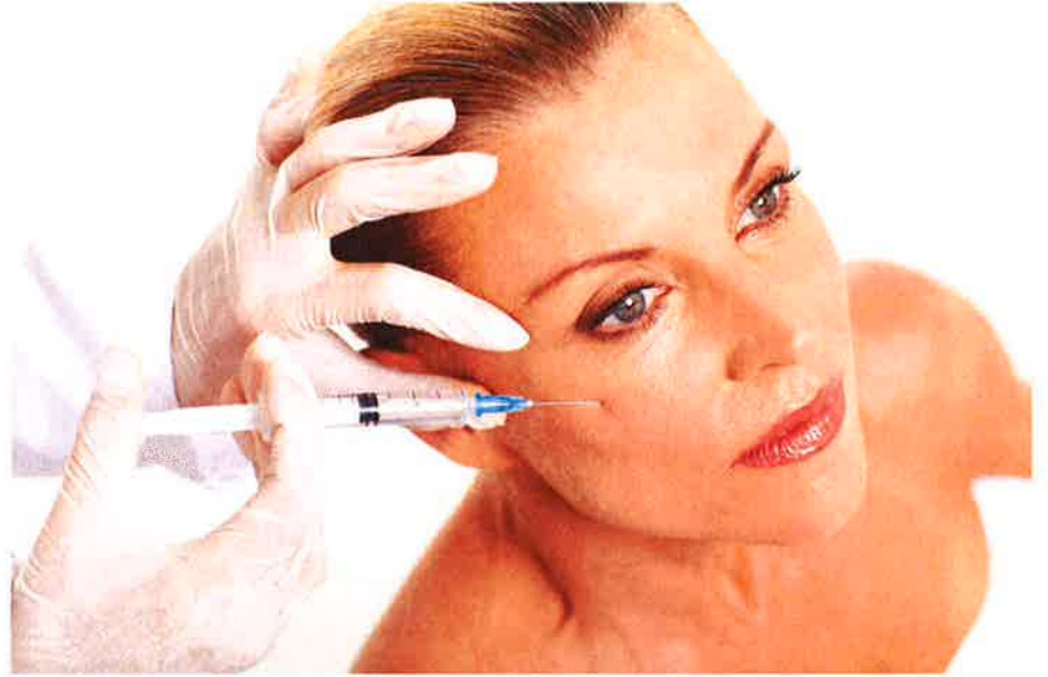
All three currently approved neurotoxin products are Type A botulinum toxins. Significant differences relate to dosing and reconstitution.

While the products have more similarities than differences, practitioners are identifying some unique